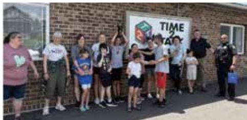
Visited Day Camp at Time To Talk LLC

The Department enjoys interacting with the community. Below are some of the events the Police Department has participated in.