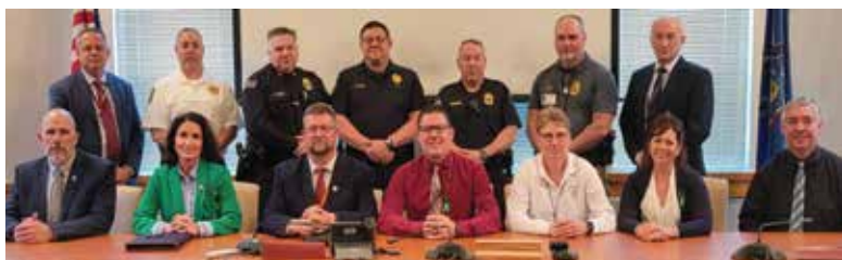
Carbon County School Safety Committee