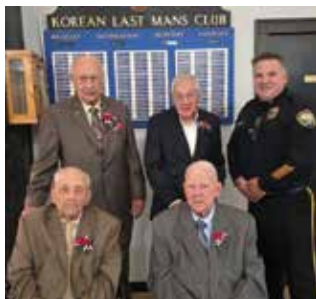
Keynote Speaker for the Lehigh Township American Legion Post 314 Korean Last Man Banquet