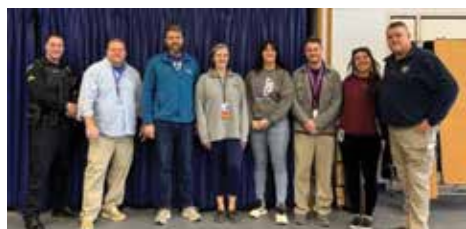
Alcohol & Narcotics Awareness Program at BHA, Willow Academy