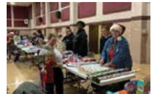
Photos from 'Shop with a Cop' 2024