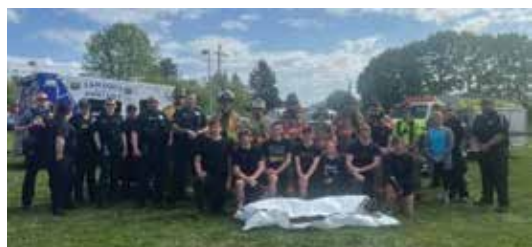
Mock car accident at LAHS for Safe Driving awareness prior to Prom.