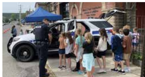
150 first graders from LAEC visit the Police Department on their walk around town.