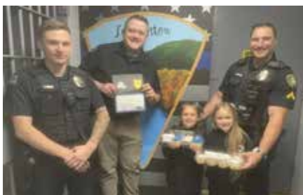
Treats for National Police Officers Day