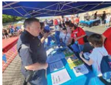
Jim Thorpe Special Needs Olympic Games for students from all over Carbon County