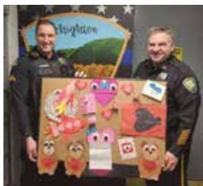
Homemade Valentine's cards from the 'Touch A Heart' Campaign.