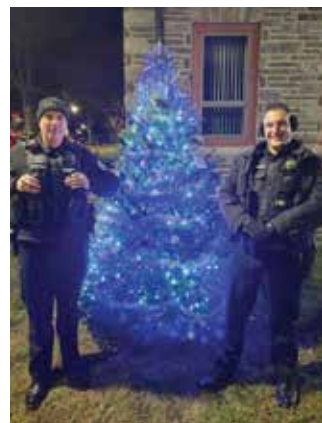
Lehigh Township's Borough's 9th Annual Christmas Trees in the Park Lighting

Property Owners - Please clear snow from school bus stops and from around neighborhood fire hydrants. Snow should be cleared a minimum of 3 feet completely around the hydrant.